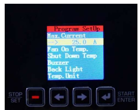
Picture 3 Program setup

value, press the START/ENTER button to the value blink then change the value with the DEC or INC buttons. The new value will be confirmed and saved by pressing the START/ENTER button