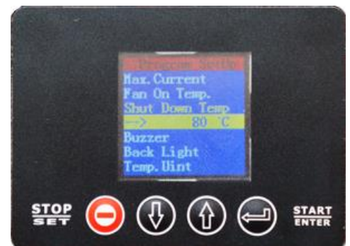
Picture 3 Program setup